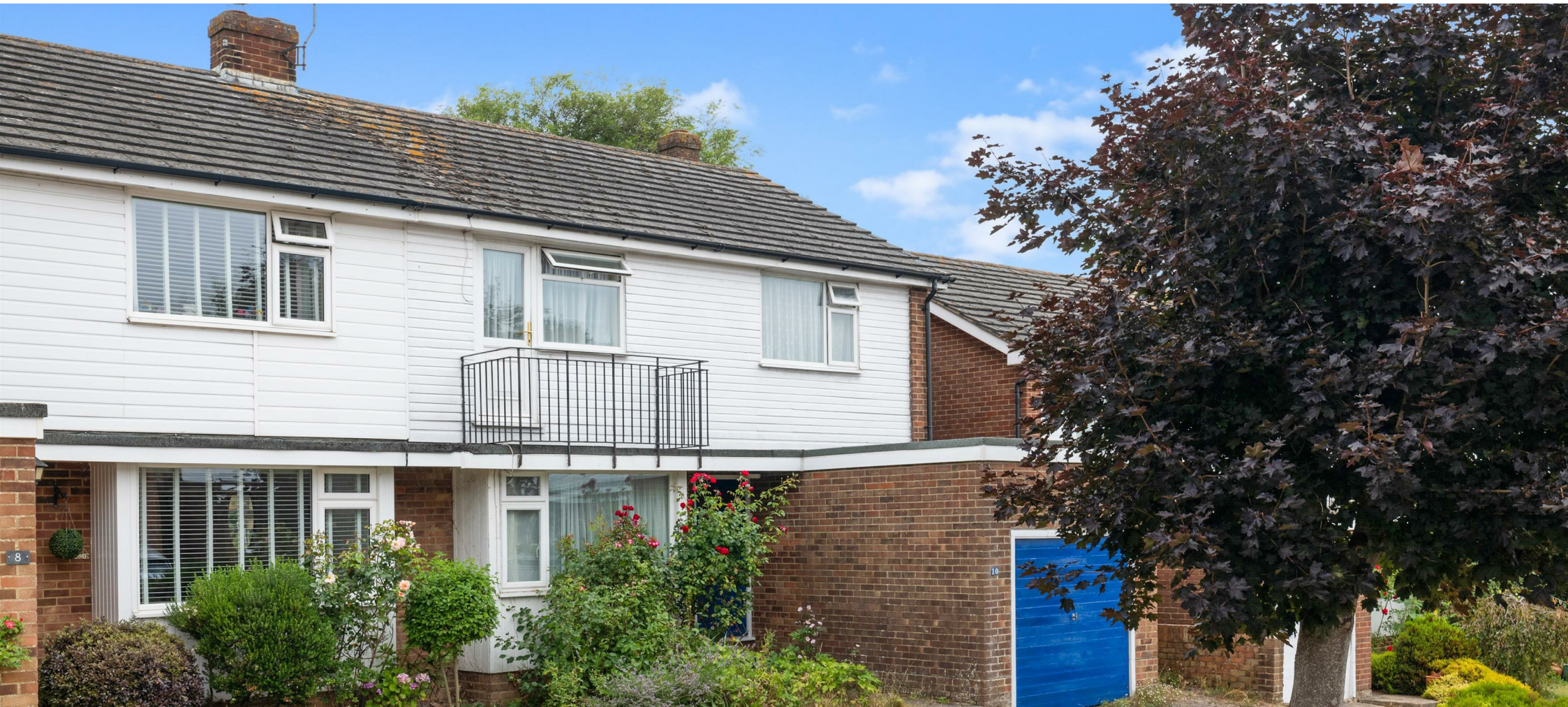
Grantham Bank, Barcombe, Lewes